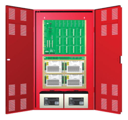
CAB-50 w/DAB-7, PS-7A's & Batteries